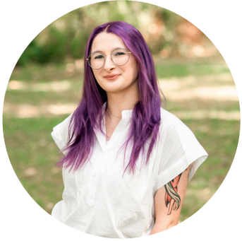
AVA Marvin MT-BC

Areas of Focus: Clinical supervision, team development